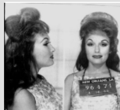
Mug shot from New Orleans, LA, April 16, 1963.